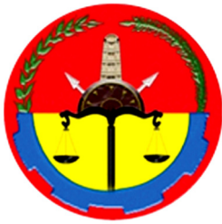
የትግራይ ክልል ከተማ ልማት፣ ንግድና ኢንዱስትሪ ቢሮ Tigray Bureau of Urban Development, Trade and Industry